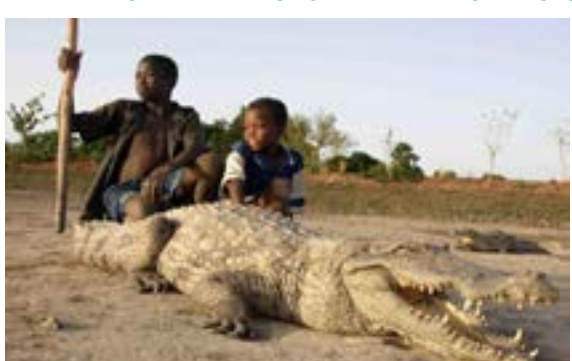
PLATE 1: HUMAN INTERACTION WITH THE TOTEM CROCODILES OF PAGA IN GHANA

The human-animal harmony depicted in the totemic ontology of the Bebelibe nation is concretely demonstrated in the several sacred crocodile ponds in Paga located (for 91 Days, 2019) in the Upper East Region of Ghana and inhabited mainly by the Kassena people (Africa 101 Last Tribes, 2022) who consider the crocodile as an embodiment of the soul of their nation (Amenuveve, 2021). They recount their association with their totem as being the result of a chance encounter when the founder's ancestor, Nave, was saved from dying by a crocodile while on a hunting trip. He subsequently decreed that crocodiles were not to be harmed or killed for any reason. As indicated in Plate 1 below, the human bond with the reptiles is cordial.